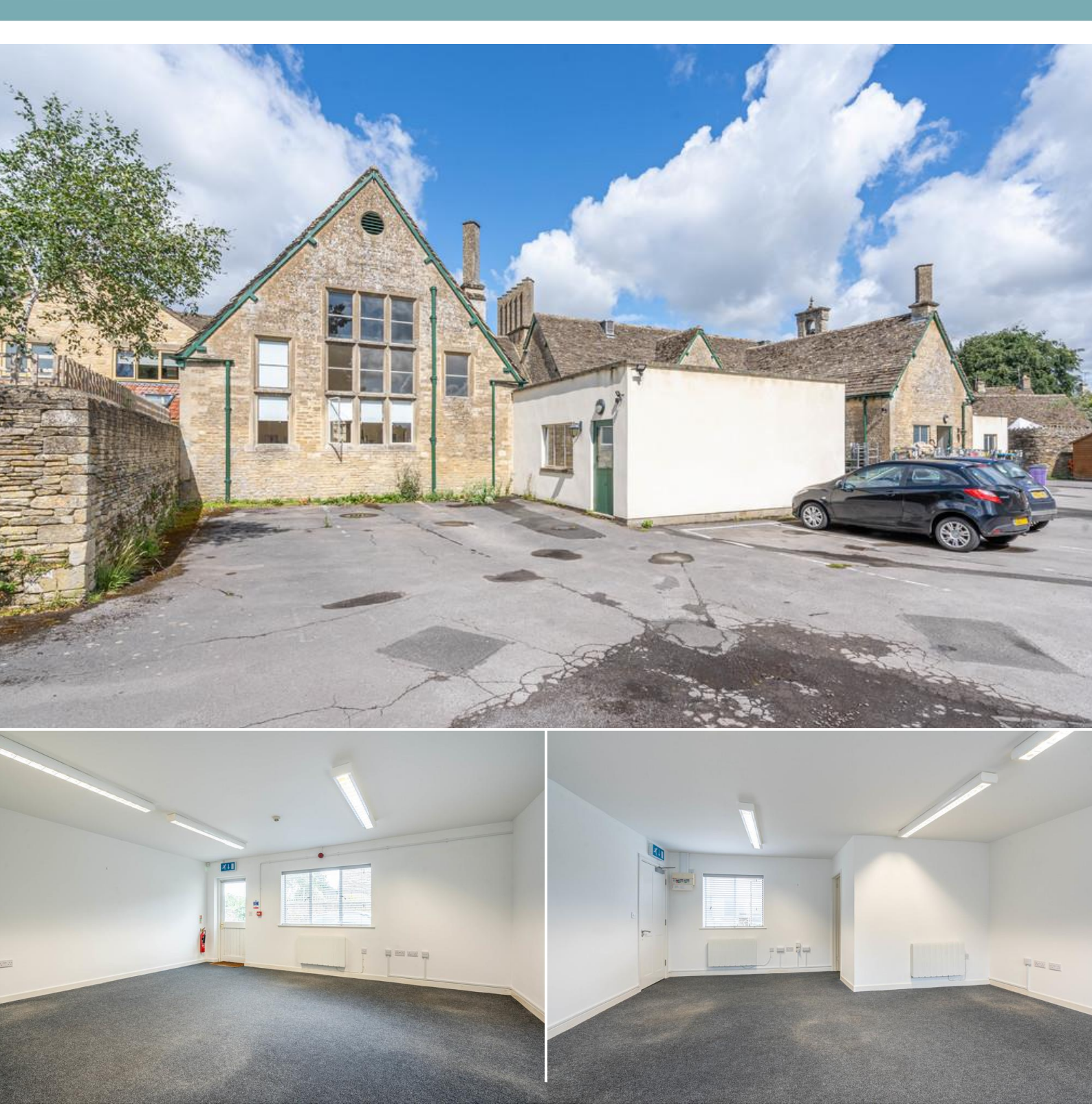
Unit 4, The Old School, High Street, Sherston, Malmesbury, Wiltshire, SN16 0LH £7,250 pa

A lovely office of approximately 347 sq ft with storage area, situated in the Old School building in Sherston. Parking and shared kitchen/toilet facilites, buildings insurance and service charge included.